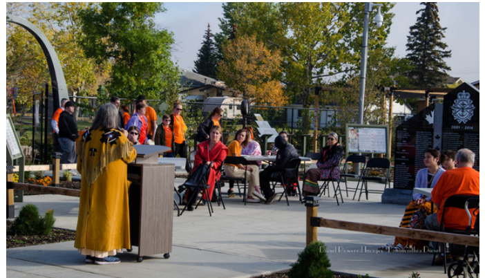
Pancake Breakfast - Truth & Reconciliation Day