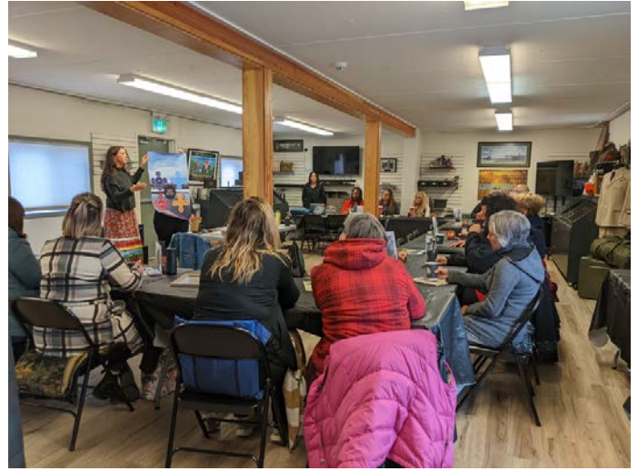
Indigenous Tourism Alberta Training