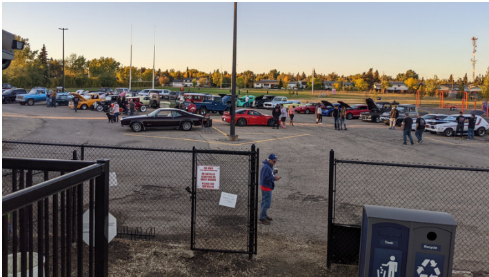
Cruise In for History Chanel's Lost Car Rescue Show